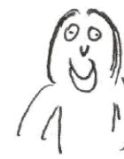
Sunday Group Leaders